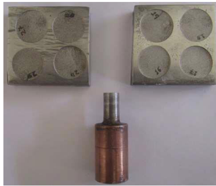
Fig. 1 Machined work piece and Tool

The tool material used in Electro Discharge Machining can be of a variety of metals like copper, brass, aluminum alloys, silver alloys etc. The material used in this experiment is copper. The tool electrode is in the shape of a cylinder having a diameter of 21mm